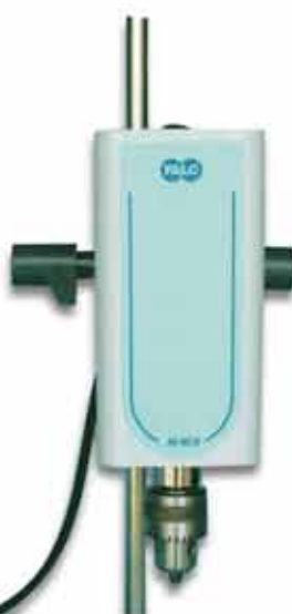
AT - DIGITAL REMOTE CONTROLLER