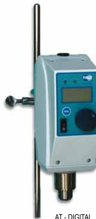
AT - DIGITAL