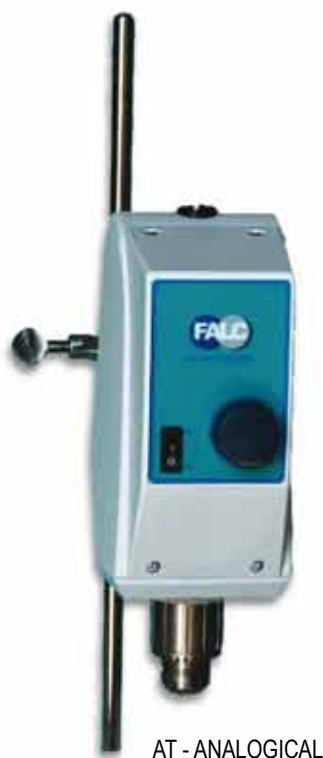
AT - ANALOGICAL